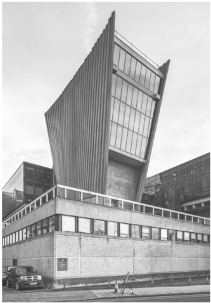
Department of Physics Arup