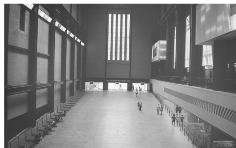
Tate Modern Herzog de Meuron