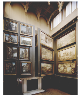
Sir John Soane's Museum John Soane