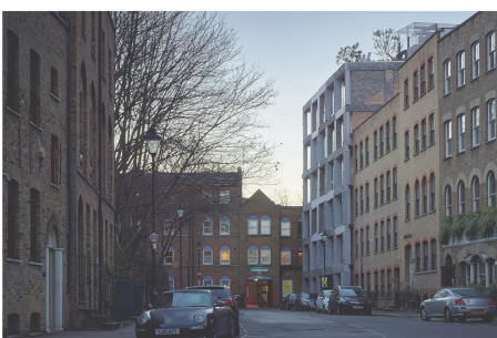
Clerkenwell Close Groupwork