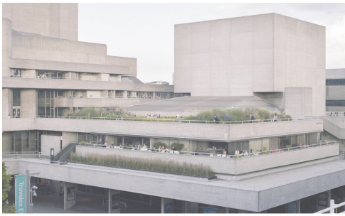
National Theatre Denys Lasdun